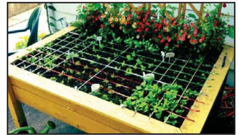
Photography for example

First: the Municipality is developing a community garden! You can put your two cents in by participating in the planting, maintenance and harvesting! If you wish to participate in this great community project, don't hesitate to give us your name, specifying what part or parts you are interested in for this project.