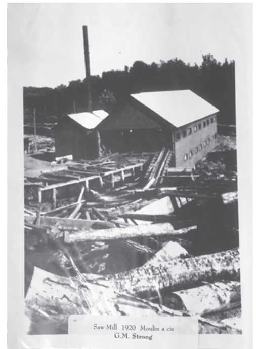
Saw Mill 1920 Moulin a cie G.M. Strong