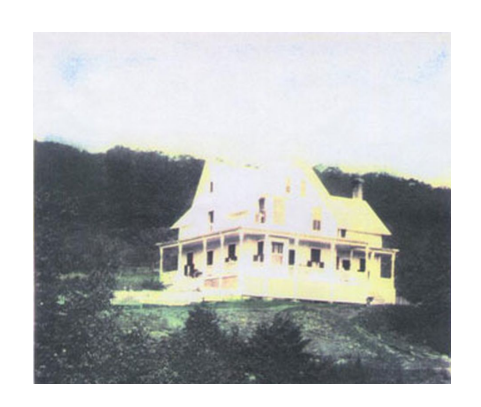
Secondary house of the Strong family, photo taken in 1900

The Strong family also owned a building called "Woodland House", which was apparently their main residence. But where was it located? In the wooded area of their land as its name identifies it. Yet, in the photo, it is surrounded by fields and you can even see a house to the right of it.