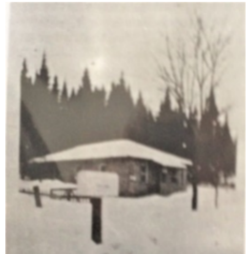
Ward's Brothers dance Hall