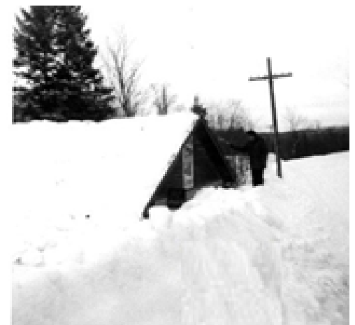
Lake George Dance Hall