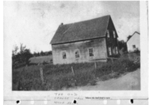
The Orange Hall of Mille-Isles