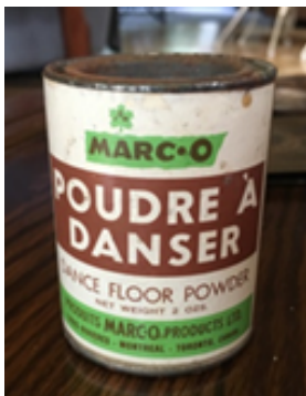
Dance floor powder