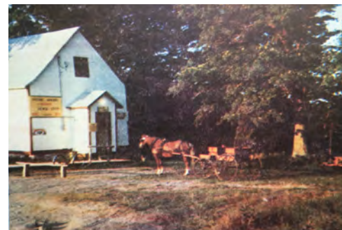
Le Black's store

In the summer of 2008, the Maple Grove was part of the Built Heritage inventory of the MRC d'Argenteuil, which was presented in the spring of 2009. In 2014, the Municipality took over the school. Historians say that in Quebec, between the years 1850 and 1960, there were about 6,000 schools of row. From now on, there are only a few left, including the small "Maple Grove" school. Although she was a silent witness in our village hamlet for a long time she clings to the present marked by time, but very soon there will be a rebirth.