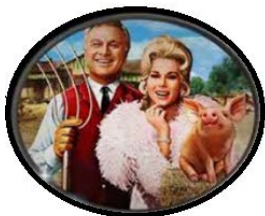
Zsa Zsa Gabor