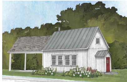
Proposed sketch Maple Grove building

* This project benefits from a grant from the Programme de développement économique du Québec / Fonds canadien de revitalisation des communautés)